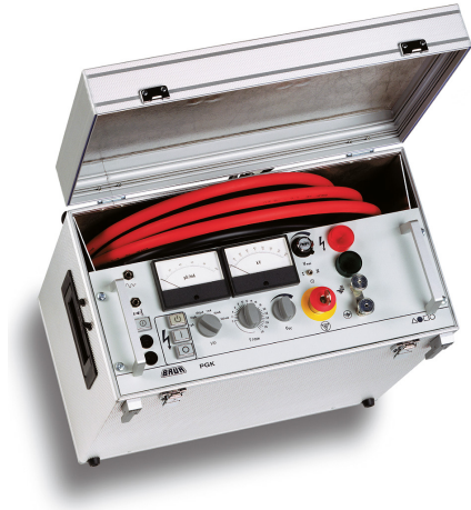
The figure is illustrative.